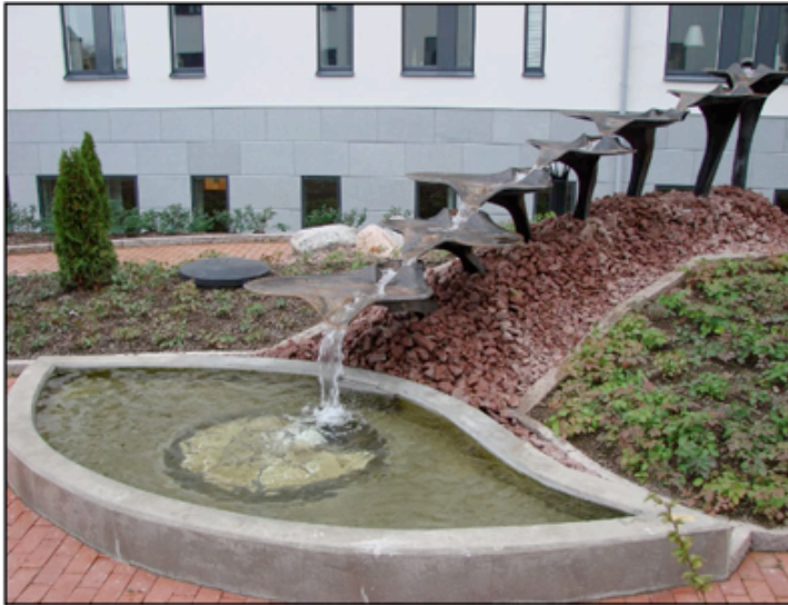
Linköping Sweden, bronze cascade in a patio of a clinic - Design: Nigel Wells