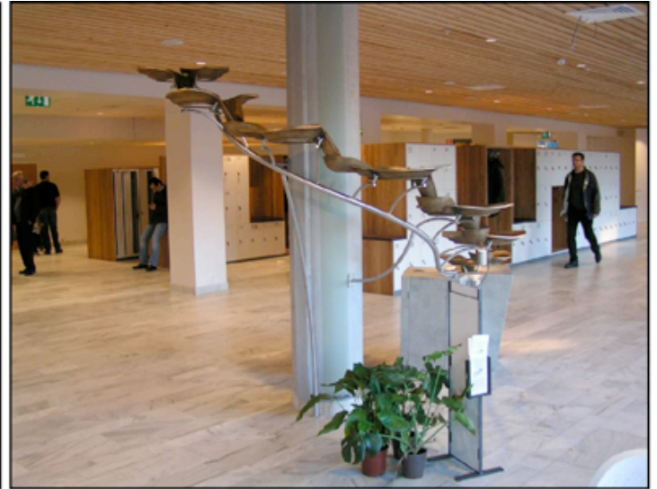
Södertälje Sweden, bronze cascade in the town center - Design: Nigel Wells